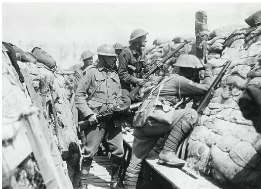
A trench near Armentieres