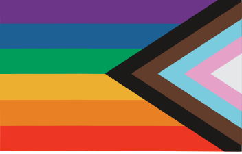
The LGBTQIA+ Flag Answers on page 49