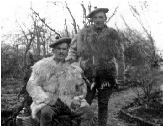
Two soldiers in their sheepskin outfits.