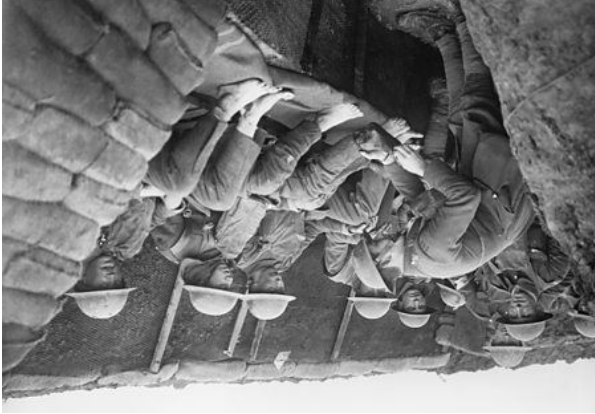
Soldiers taking care of their feet in order to revert trench foot.

The trenches were built up from the ground, not dug down into it, and were comparatively dry and comfortable.