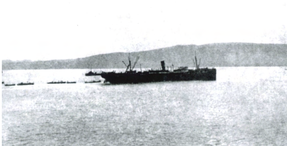
Ship carrying the 13th Battalion Royal Highlanders of Canada from Avonmouth to France.

Embarkation of men, horses and wagons was smartly carried out, after which the men were allowed to get some sleep. Along with 31 officers and 1002 men of the 13th, the S.S. Novian also carried the Divisional Ammunition Column, with the compliment of over 200 horses.