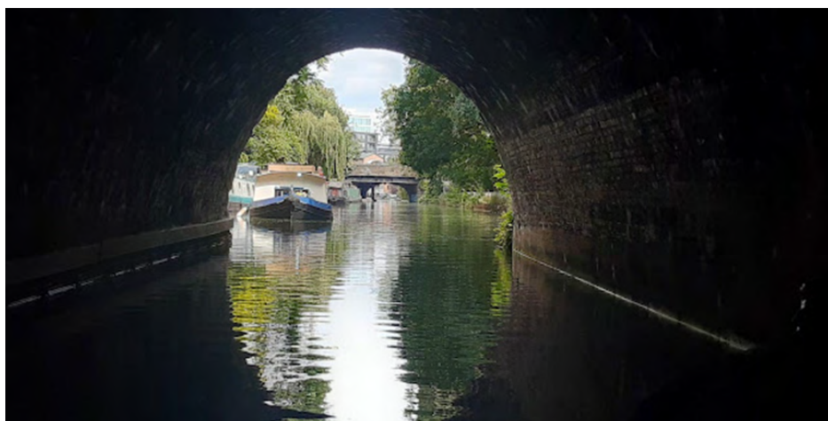
The mile long tunnel going under Angel

We all had a very enjoyable & informative day out. We are hoping to go again sometime next year.