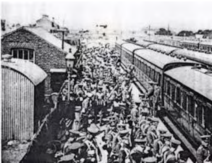
Troops getting on a train at Larkhill Camp.