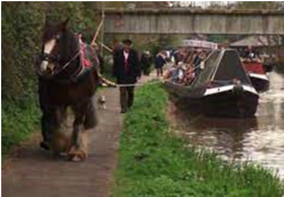
A horse pulling a canal boat, as they would before engines.

Before diesel, the barges were pulled by horses, hence the name tow-path for the bit of land either side of canals. Horses also needed frequent stops at stables, providing rest, food, new shoes (if needed) etc. In the 1900's the museum building was converted into a stables and opened as a museum in 1992.